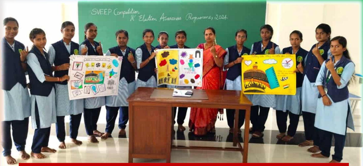
NSS volunteers participated in SVEEP competition